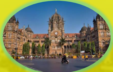
Chhatrapati Shivaji Terminus