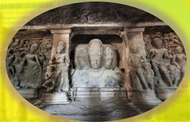
The Elephanta Caves