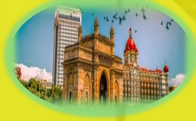
Gateway of India