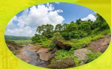
Sanjay Gandhi National Park